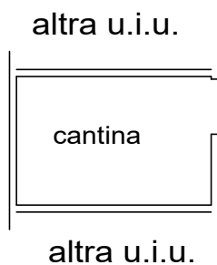
PIANO 2 INTERRATO h=2.60m