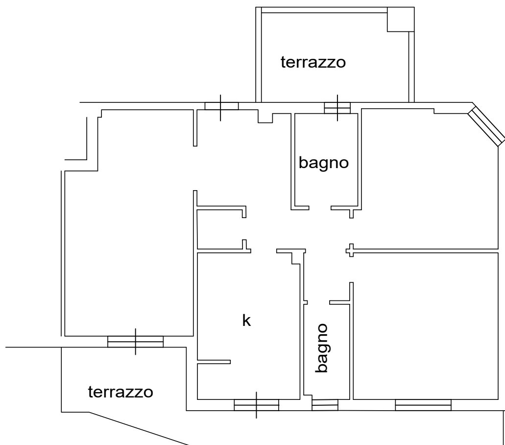
PIANO QUARTO h= 3.00 m