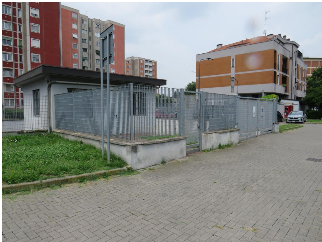
INGRESSO SU AREA DI DISIMPEGNO